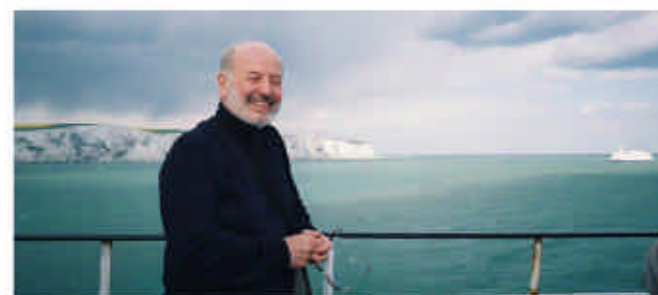
Last glance between sky and sea on cliffs of Dover. R.M.A

©Reproduction publique sous réserve d'accord www.arturbain.fr