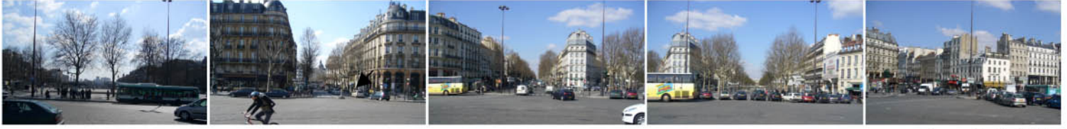
Views around the Place de La Bastille