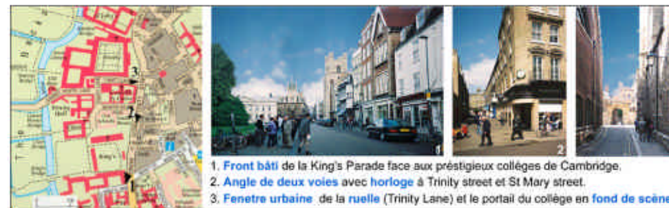
1. Front bâti de la King's Parade face aux prestigieux collèges de Cambridge. 2. Angle de deux voies avec horloge à Trinity street et St Mary street. 3. Fenêtre urbaine de la ruelle (Trinity Lane) et le portail du collège en fond de scène .

For linear sequences: Identify numbers and view angles of shots on the map with the help pointers :