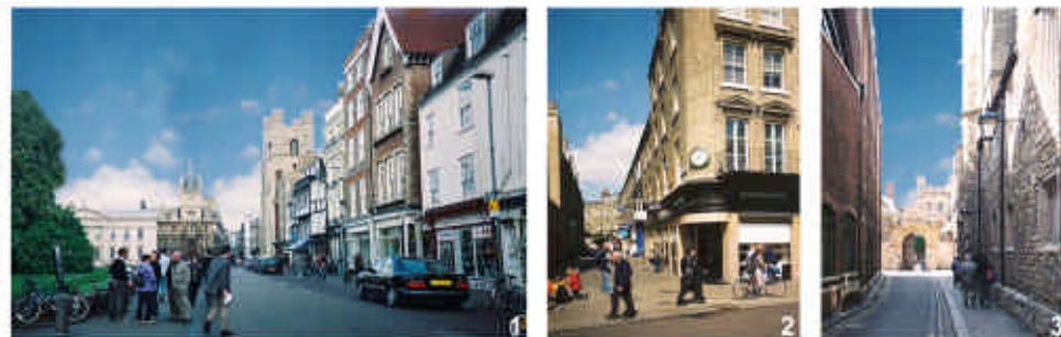
1. Built front of the King's Parade vis-a-vis with the prestigious Cambridge College. 2. Angle of two ways with clock between Trinity street and St Mary street. 3. Urban window of the lane (Trinity Lane) and the gate of the college in background .