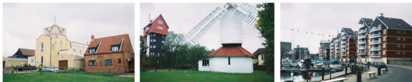
* "Let us be practical, clever, transform the inheritance and make business" !!

Thorpe The house of God was deserted, the church, near the beach, was arranged and sold in residences of holidays.