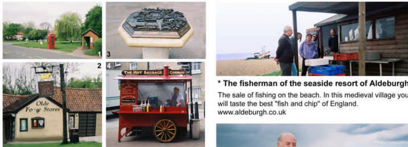
* A useful, beautiful and durable urban furniture