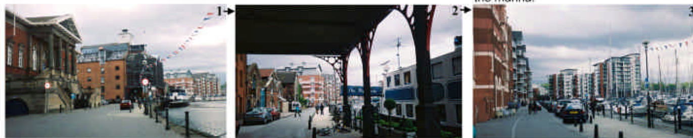
* Linear sequence : 1 → 2 → 3, in Ipswich, on the quay of the Water front. www.chooseipswich.com

Ipswich The "Water front": old warehouses transformed into hotels of luxury and apartments, vis-a-vis with the sailing ships of the marina.