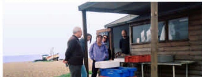
* The fisherman of the seaside resort of Aldeburgh The sale of fishing on the beach. In this medieval village you will taste the best "fish and chip" of England. www.aldeburgh.co.uk